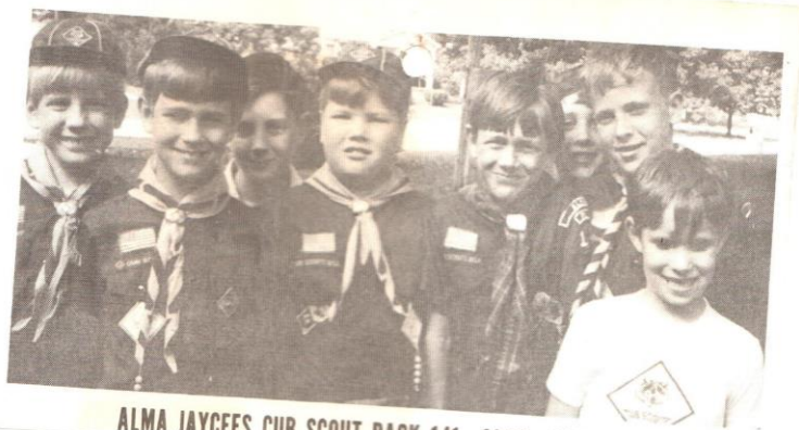
ALMA JAYCEES CUB SCOUT PACK 141 ALMA, MISSOURI