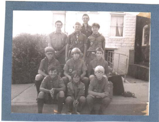
ALMA BOY SCOUTS