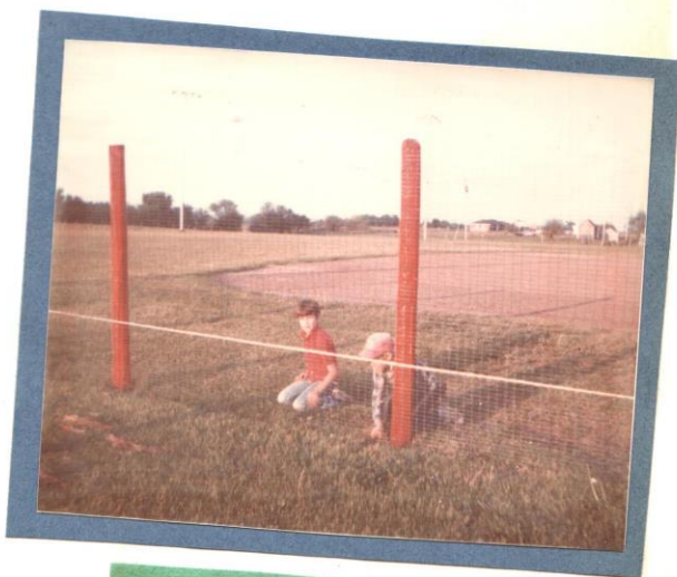
ALMA CUB SCOUTS Pull weeds at ball park