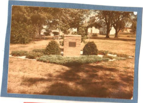
TIEMAN-BLACKBURN AMERICAN LEGION MEMORIAL MONUMENT