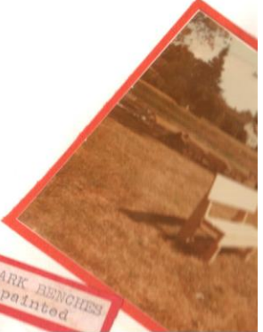
PARK BENCHES Repainted