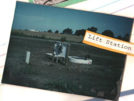
Lift Station for Sewer plant