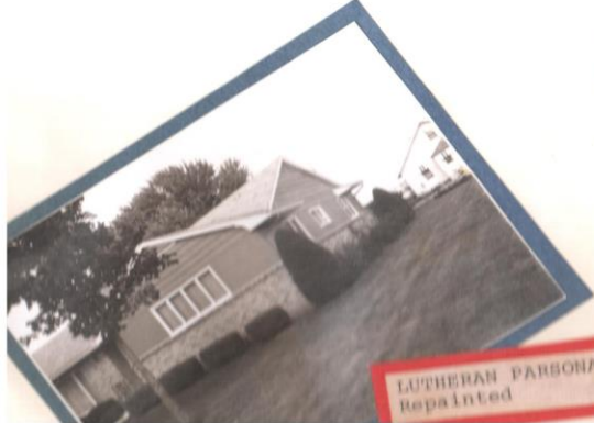
LUTHERAN PARSONAGE Repainted