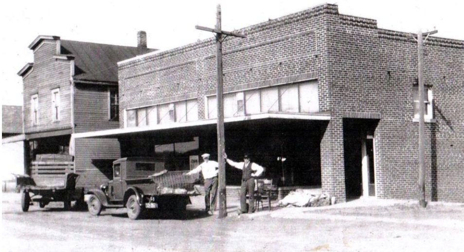
Downtown-East side of street (Herman Bremer's first store)

This building is currently PJ's Daycare!